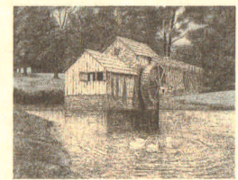
Twilight Z at the Old Mabry Mill

All information contained herein is true and correct and is kept in confidence accessible only by the registered owner or designated agent. To transfer this certificate of authenticity to new Ownership, please send to Eric White Fine Art Studio, P.O. Box 1134, Dandridge, TN 37725. Note: only the current owner or designated agent is authorized to make such changes. All rights reserved.